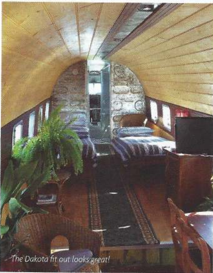
The Dakota fit out looks great!

Narrikup. Again we were met with some striking views; however, the wind had picked up and it was a bit bumpy.