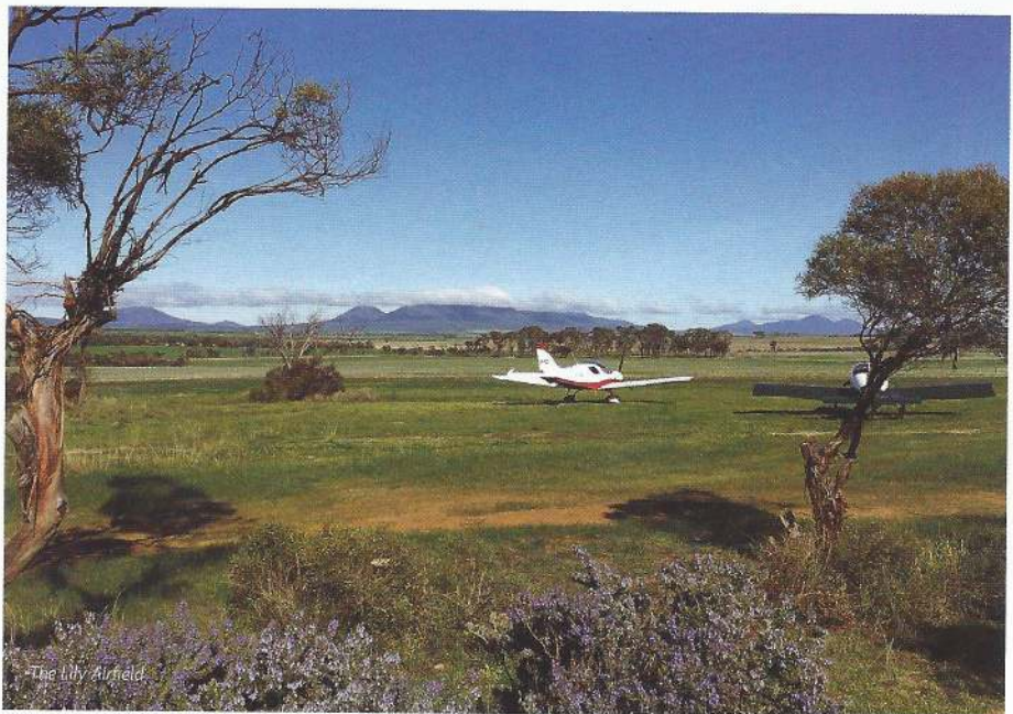
The Lily Airfield