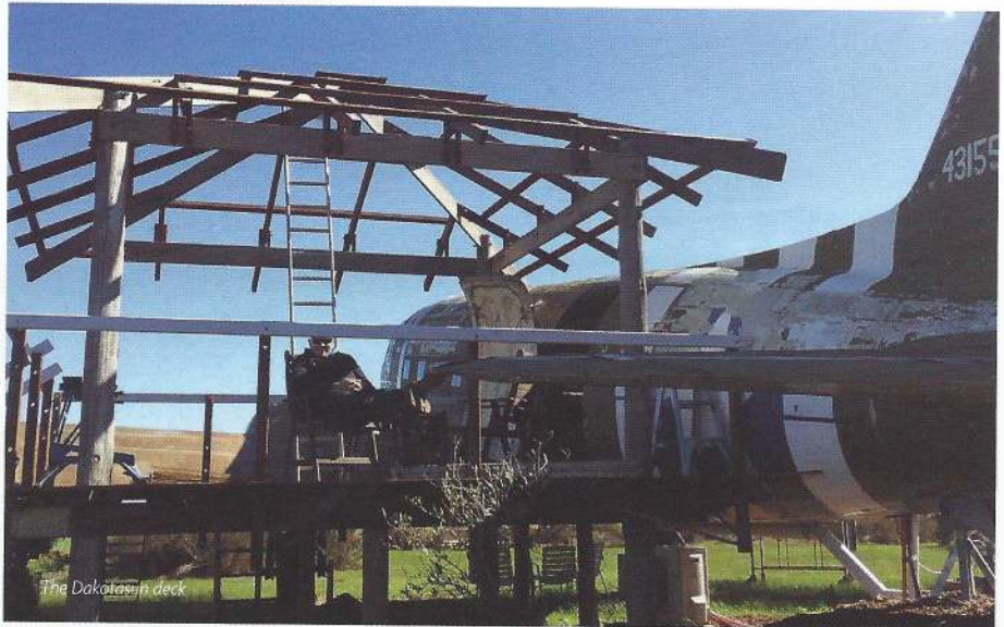
The Dakota's deck

VH-EZT is owned by University Flying Club and the volunteers go to extraordinary lengths to provide an affordable entry into aviation for many pilots. The club is celebrating its 50th Birthday this month. If other pilots want to get involved in the club, and fly VH-EZT they should check out our website: www.uniflying.org.au/ ➤